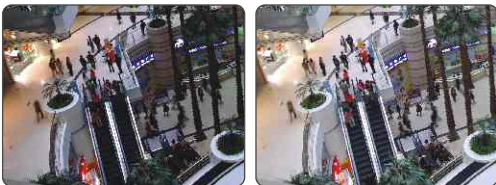
AGC OFF (Day time low light)