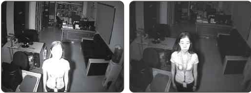
SMART IR OFF